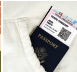
Easy-to-Access Travel Itineraries