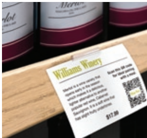
Scannable Shelf Displays