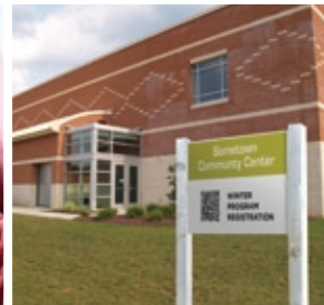
Community Center Information