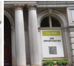
Employment Opportunity Postings