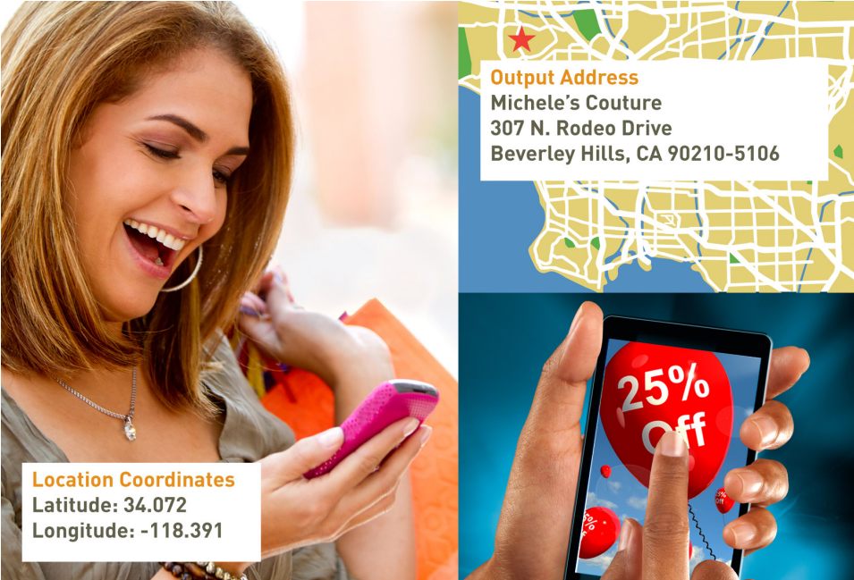
Bridging the gap between retail and social media, reverse geocoding allow you to capture a GPS signal from a customer's mobile phone, determine their precise location—and then deliver an offer at the right time and place.

Information delay: When it comes to applying location-based insights to consumer needs and preferences for marketing purposes, the critical element—understanding where a consumer actually is at a point in time (unless, they are in the midst of a transaction), hasn't been possible—instead, marketers have had to make best educated guesses on where they will be.