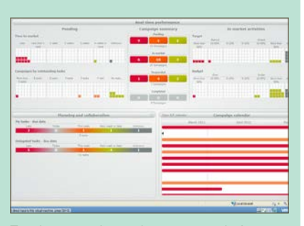
Track cross-channel recommendation performance with real-time accuracy.