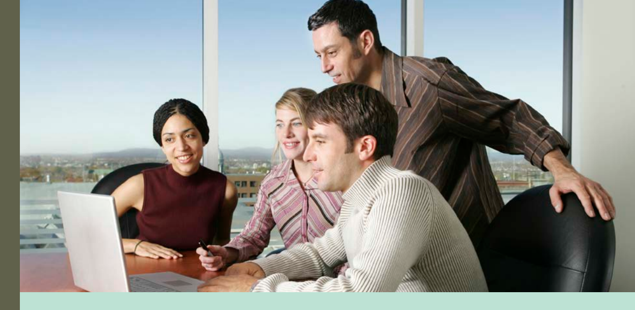
Marketing and customer experience professionals can now craft and orchestrate a personalized customer experience, across all touch points.