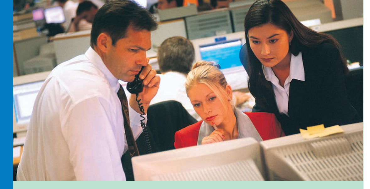
Some solutions may sound similar, however only Portrait Interaction Optimizer™ is a true real-time best-next-action solution.