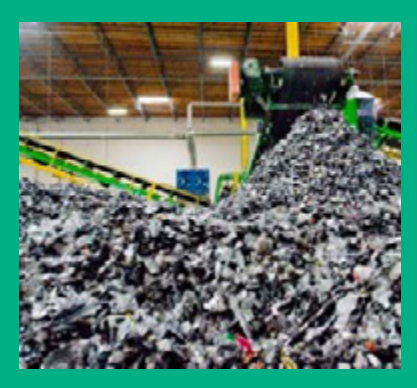
E-waste processing in Indianapolis, IN

Our selection of a recycling vendor was based in part on the firm's guarantee that all e-waste would be broken down for reuse and no e-waste would be shipped overseas. We verify the firm's performance through audits and compliance checks as well as the tracking of waste quantities. In 2011, 1,952 tons of U.S. electronics waste were recycled.