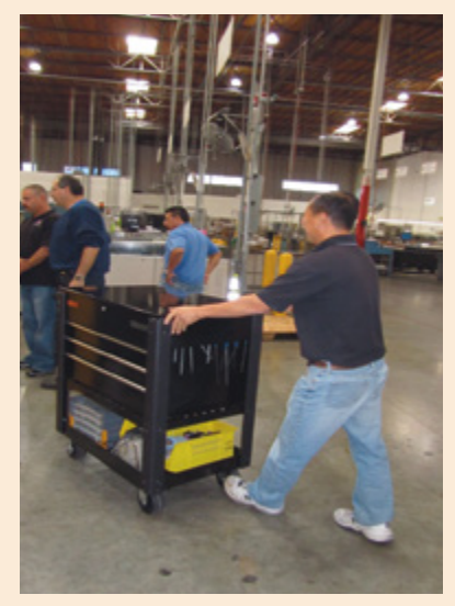
Ergonomic Kaizen Team at Pitney Bowes Presort Services Rancho Dominguez Site

We developed a video about Avoiding Slips, Trips and Falls. We also sent additional Find It Fix It Kits to more than 100 Pitney Bowes facilities during the year. These kits include posters, videos, training materials, worksheets and customized supervisor and employee handouts on topics such as avoiding slips, trips and falls, assessing risk and conducting thorough incident investigations.