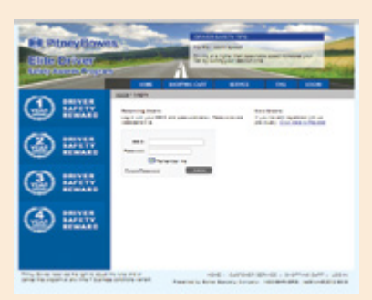
Pitney Bowes Elite Driver Safety Awards Program website