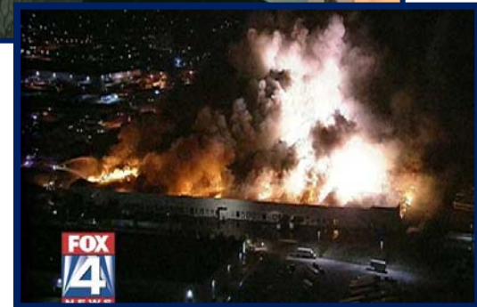
February 8 th , 2011